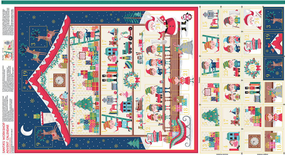
2227/1 Santa's Workshop Advent Calendar Panel